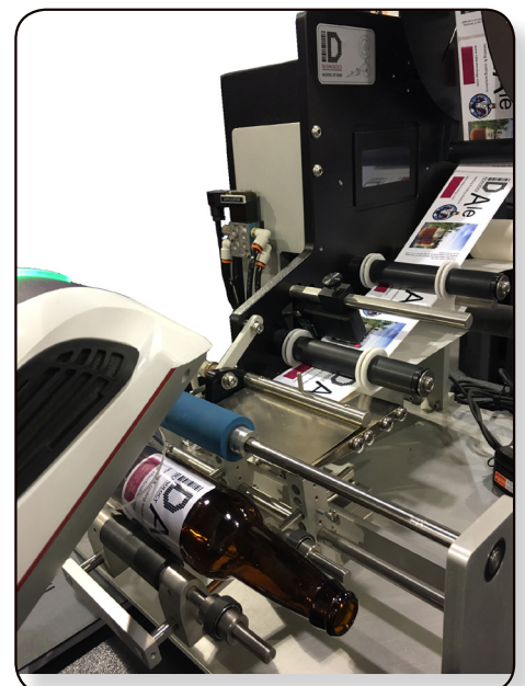
Semi-automatic labeler with Laser Coder

The LSI-9110 is a simple, but robust, semi-automatic labeling machine that is built around our ST1000 labeling head. For vintners who need high-quality labeling for lower volume products, this labeling system is ideal.