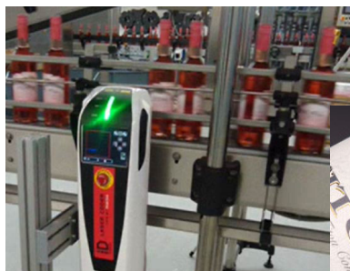
Macsa ICON Laser Coder