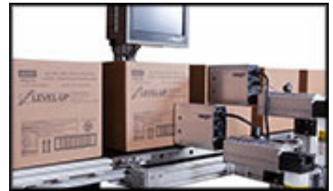
FoxJet ProSeries Inkjet Printers

Replace preprinted cases and cartons with large character printing on demand. ProSeries inkjet printers produce high quality, high resolution text, barcodes and graphic images. Various printhead configurations, provide up to 4" high print at 300 dpi print resolution.