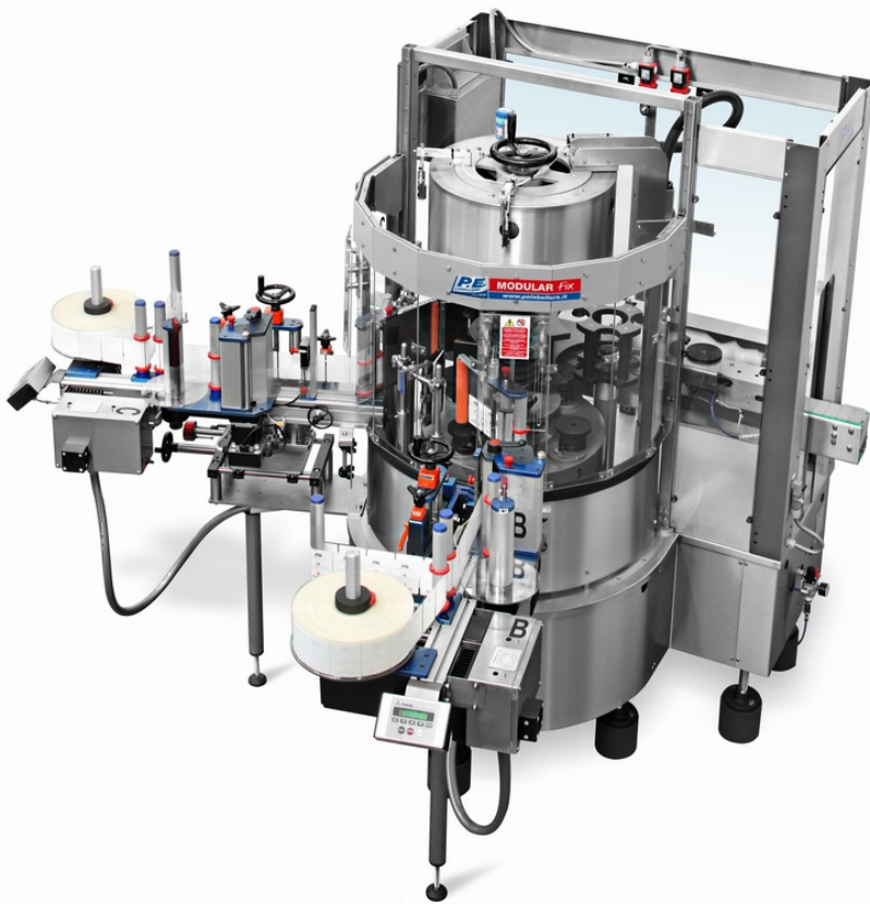
Modular Rotary Labeling System

From semi-automatic labels to complete rotary systems, ID Technology has labeling solutions for every size winery.