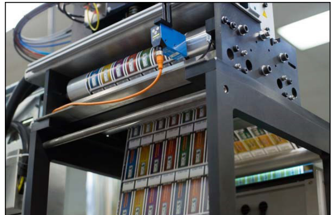
Label printing presses in six locations

For high quality color, high volume labels, flexographic printed labels from ID Technology provide the best graphic arts reproduction process for package printing. Flexographic printing can be done on a wide range of substrate materials, yielding superior quality graphics and barcodes.