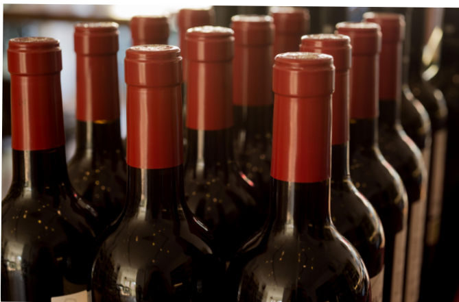
Add vintage date, net contents, or other data to neck labels.