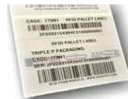
RFID Label: If you already have the shipping labels, you can add an RFID label—just like this example.

The RFID label is the simplest to make because it contains far less information than the others. That is if you have an RFID printer/encoder or you can use a label printing service to produce 100% compliant labels.