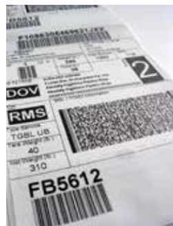
Military Shipping Label or MSL: This is the DoD label that has all the shipping and product information included.