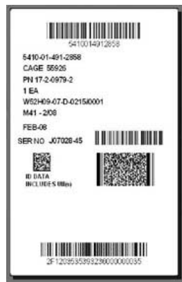
MIL-STD-129 Exterior Label: Normally you would use this along with the UPS or FedEx label. The label will look similar to that shown here to the left.

There are 3 exterior label possibilities: