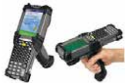
Handheld and fixed RFID Readers for accurate reading of encoded data.